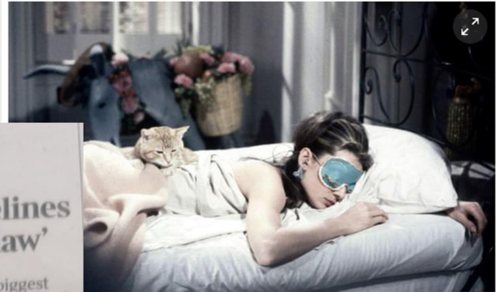
... gets her seven hours of beauty sleep as Holly Golightly in Breakfast at Tiffany's.

Leaked draft says less than seven hours' sleep can damage mental and physical health