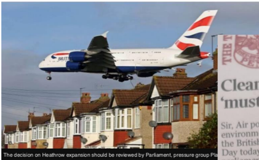
The decision on Heathrow expansion should be reviewed by Parliament, pressure group Pla

Concerns over climate change might restrict the growth of flying in the UK, government has admitted.