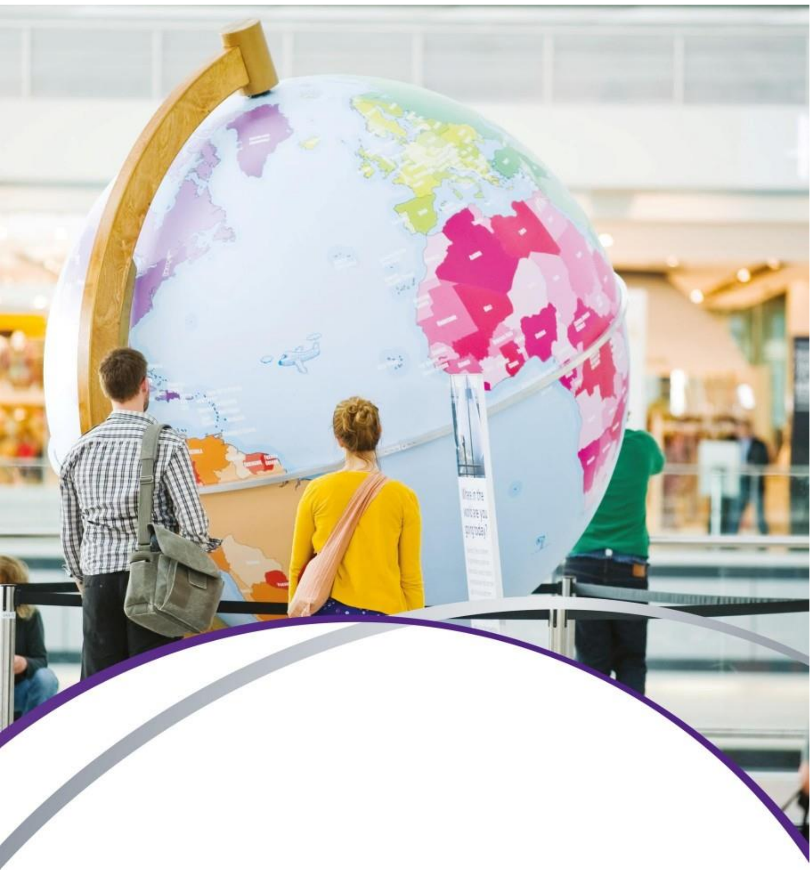
Heathrow Airport Ltd – Rail Network Code